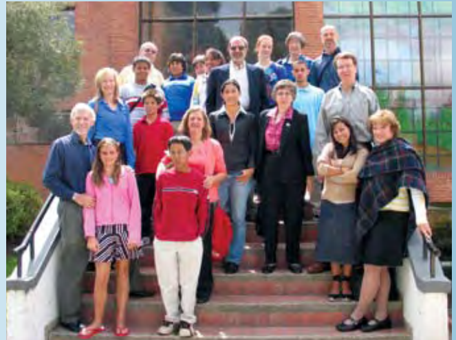
Barker Foundation Homeland Tour participants gather on the steps of FANA, preparing to enter FANA on day of our trip