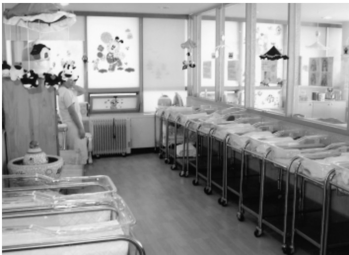
Nursery at Social Welfare Society, where babies receive initial medical screening from SWS pediatricians, prior to placement in private foster homes.