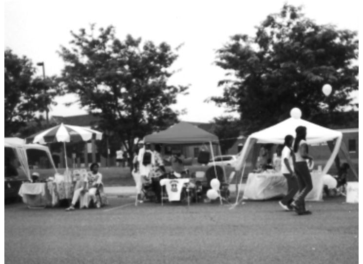
Visitors drop by the various booths at the African-American Cultural Arts Festival in Manassas, Virginia. The Barker Foundation presented adoption information at the festival and followed up with visitors who wanted more information.